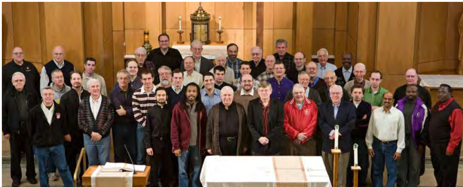
Jesuits throughout Chicagoland gathered for a final mass and reception at the altar of the chapel at the Jesuit Residence house.

For more information on CTK, please visit our website: www.jesuits-chi.org